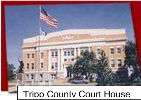
Tripp County Court House